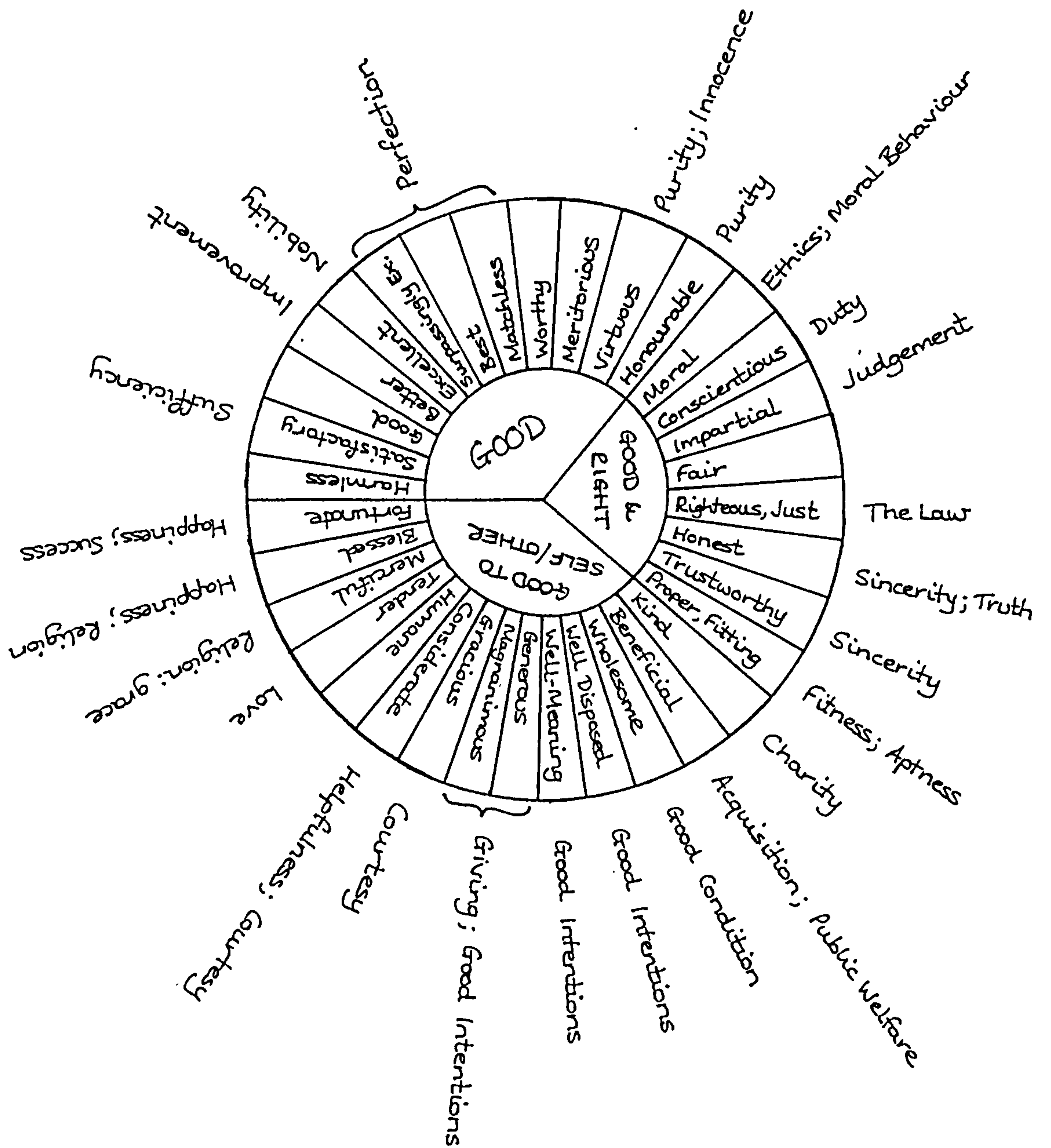
Fig. 1 Good